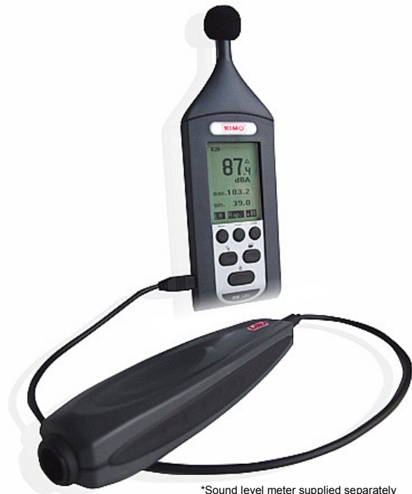
*Sound level meter supplied separately