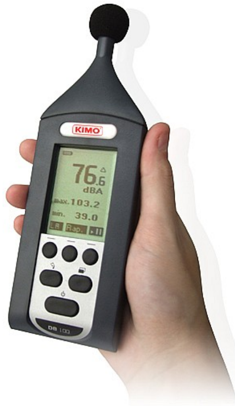
*Livré avec écran anti-vent